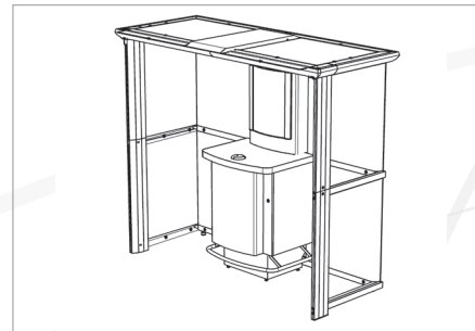
COMPACT 2-3 persons 2200 x 965 x 2165

The smoking cabin is available in four different models. Each model can be extended with options such as a lean-to support, footrest or poster display for (company) information or marketing purposes. Our range of innovative tobacco applications does not consist of smoking cabins only. We also offer air cleaners, smoking tables and ashtrays to set up a professional smoking room.