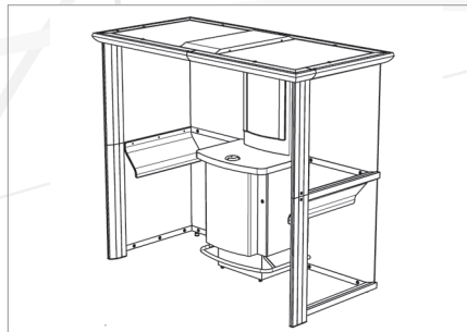
MEZZO 4-5 persons 2200 x 1215 x 2165 mm